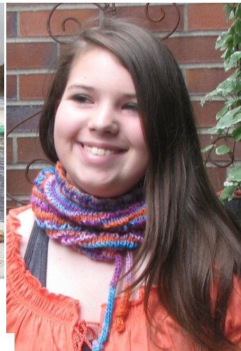
Raspberry Snoodie (Cowl & Hat in One!)