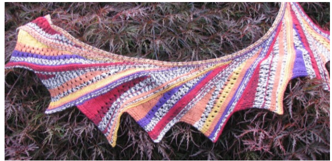
Illegal Triangles Scarf / Shawlette (just one ball of sock yarn!)