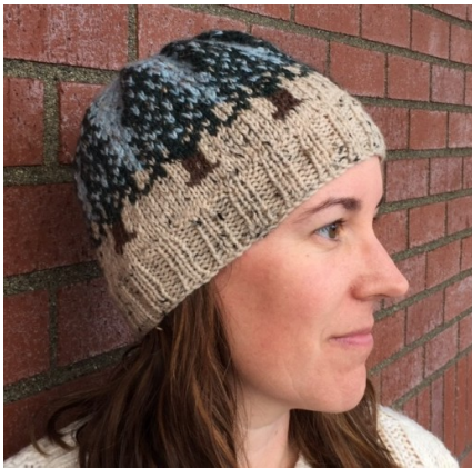
Sequoia Trees Hat