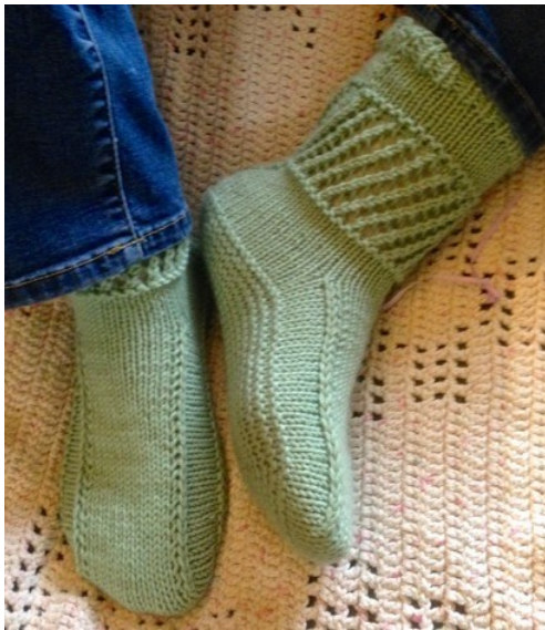
Ankle Warmer Boots