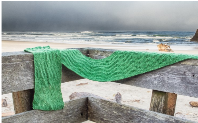
Oregon Waves Scarf